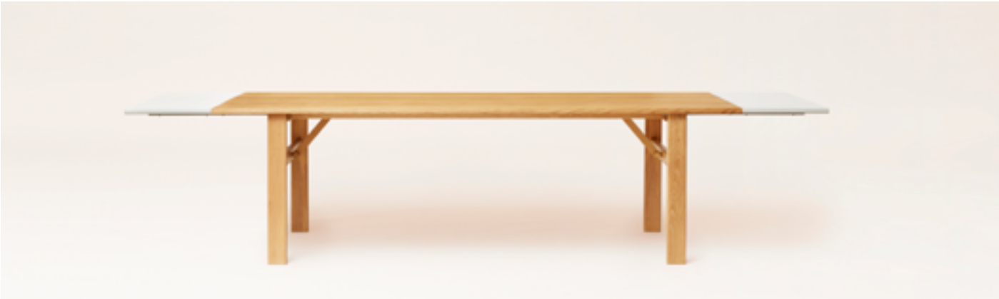
Design by Herman Studio