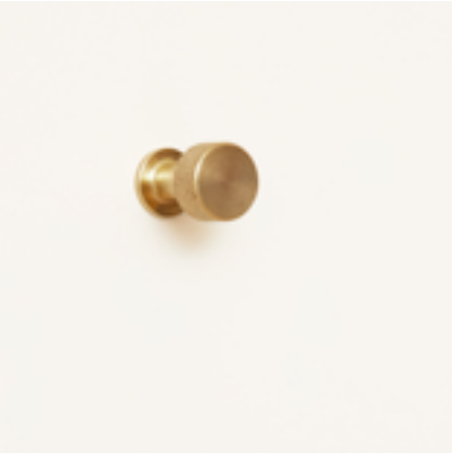
Design by Herman Studio