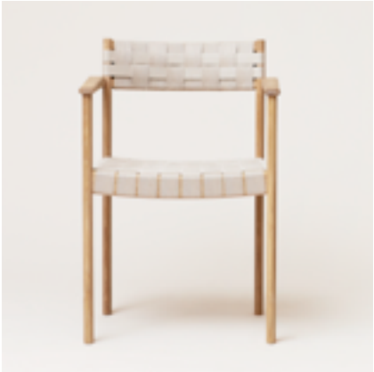
Design by Herman Studio