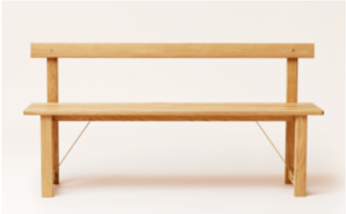
Design by Herman Studio