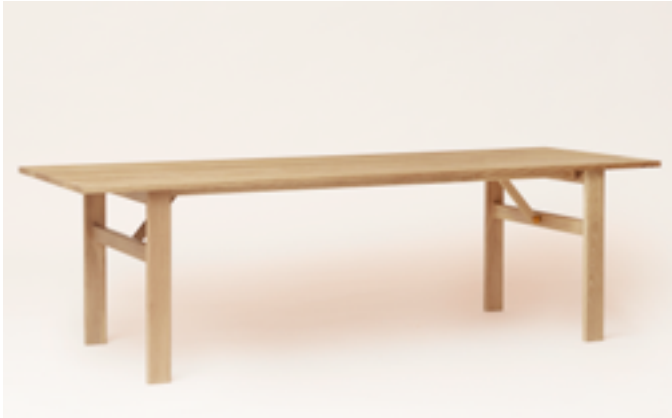
Design by Herman Studio