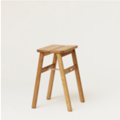
Design by Herman Studio