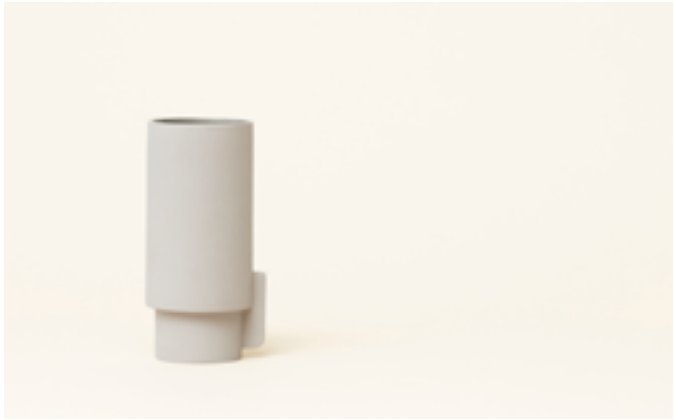
Design by Herman Studio