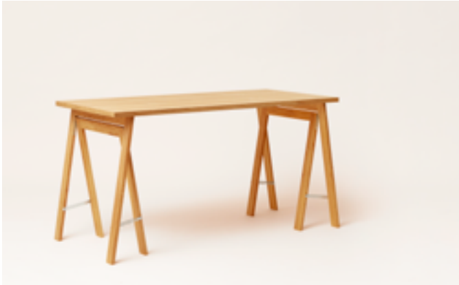
Design by Herman Studio