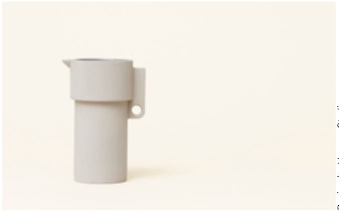
Design by Herman Studio