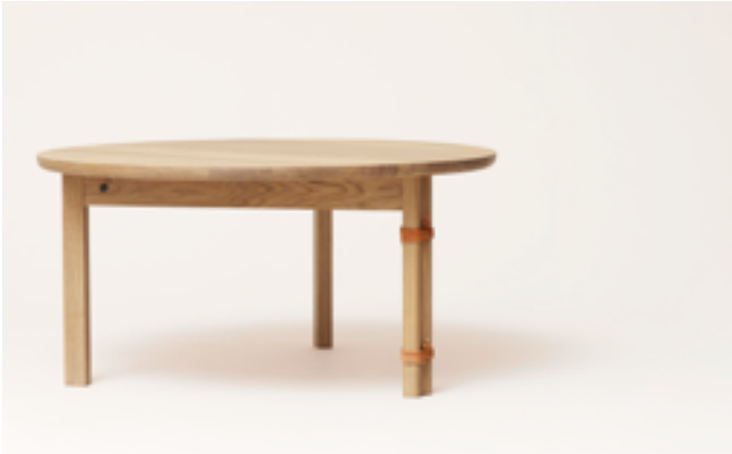
Design by Herman Studio