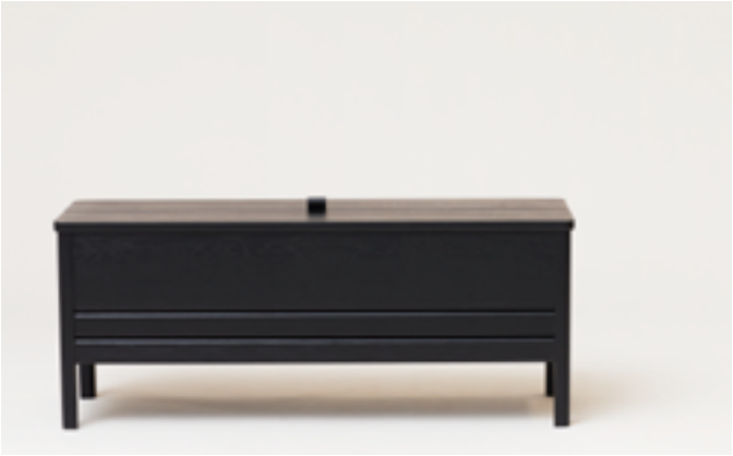
Design by Herman Studio