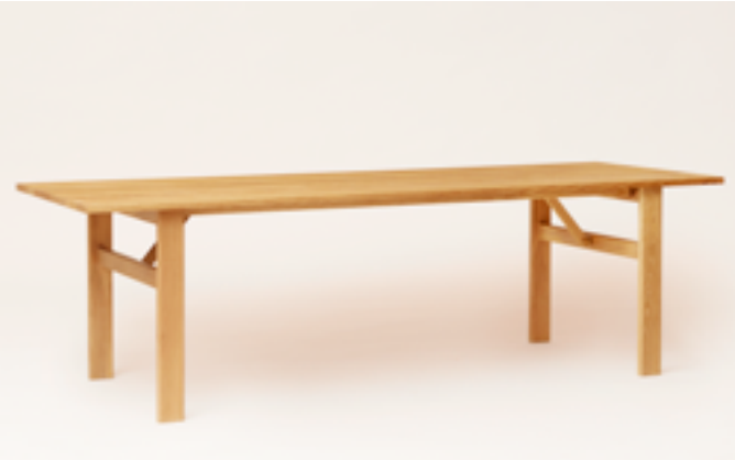
Design by Herman Studio