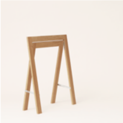
Design by Kristian Vedel