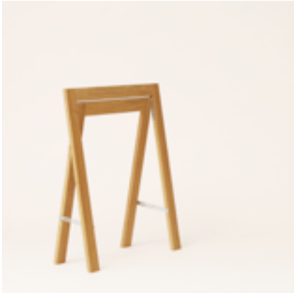
Design by Kristian Vedel