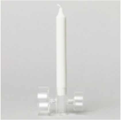
Design by Million Roses Studio