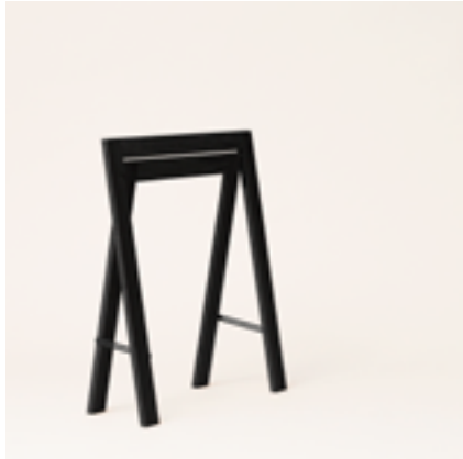
Design by Kristian Vedel