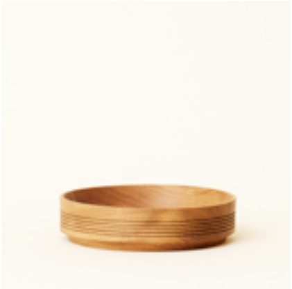
Design by Herman Studio