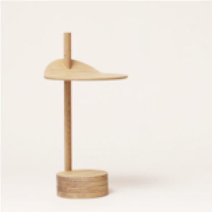
Design by Herman Studio