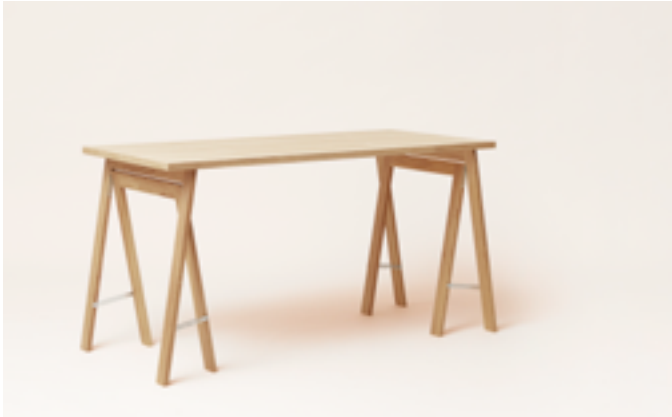
Design by Herman Studio