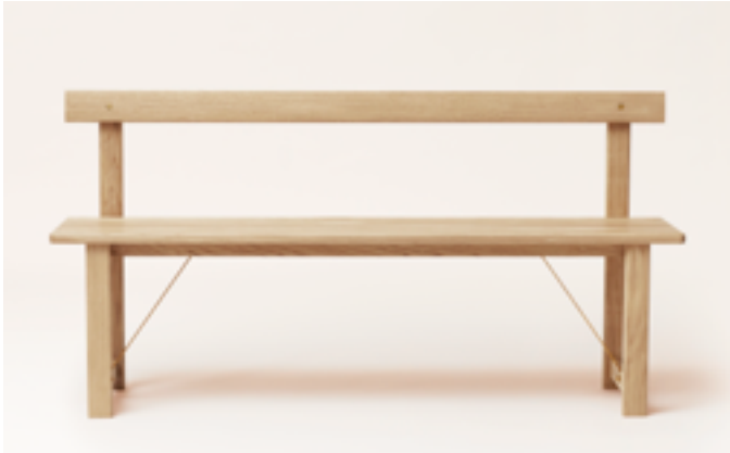
Design by Herman Studio