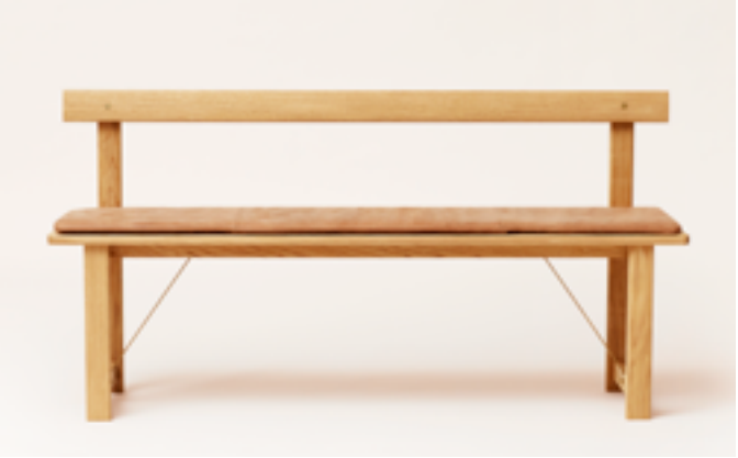
Design by Herman Studio