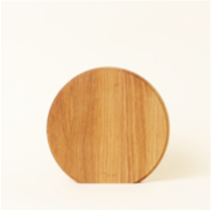
Design by Herman Studio