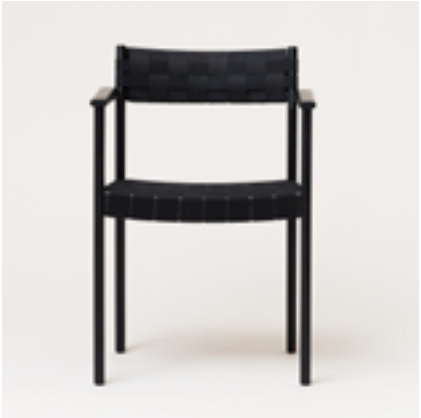
Design by Herman Studio