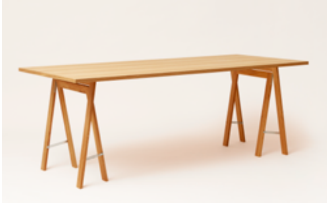
Design by Herman Studio