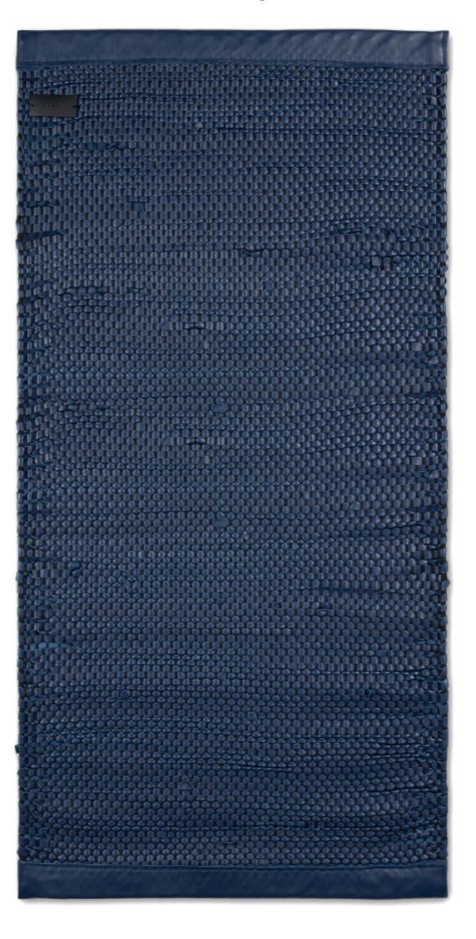
65 x 135 cm