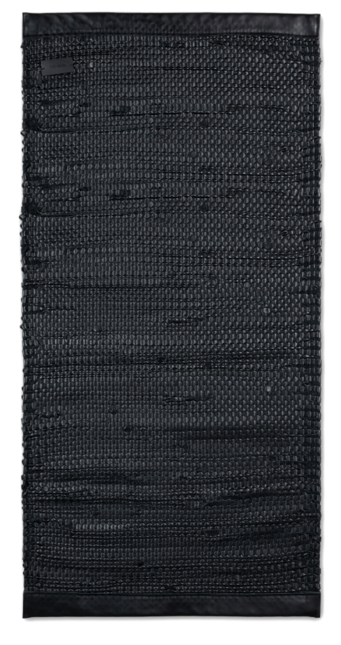
65 x 135 cm